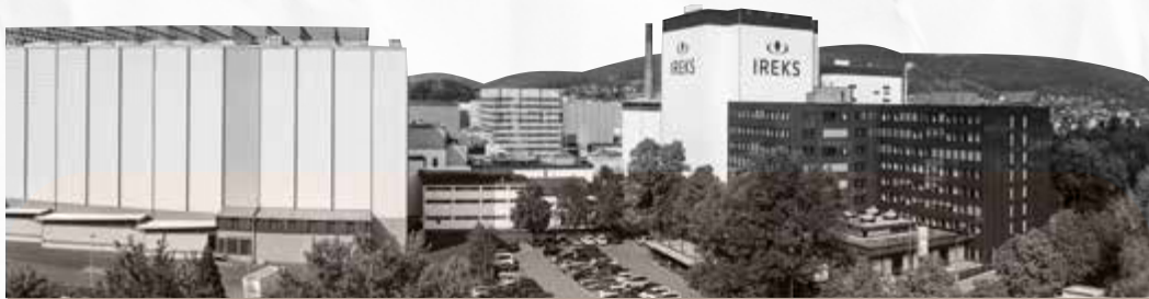
IREKS headquarters, Kulmbach, Germany

Our wide range of the best raw materials ensures baked products of the very best quality at all times. Our extensive tests guarantee consistent baking results. No matter whether you are making bread, buns, baguettes, snacks or pastry products, IREKS is able to provide a gluten-free solution for all applications.