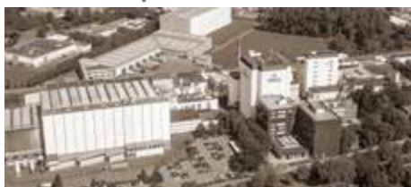
IREKS headquarters, Kulmbach